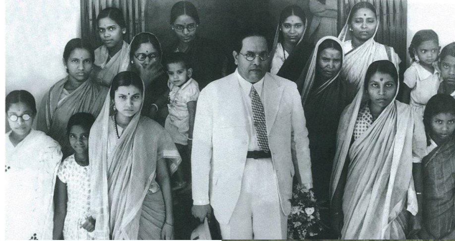
Ambedkar and quest towards dignity for all