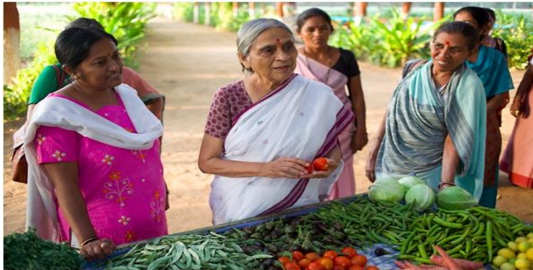
Ela Bhatt, SEWA and women entrepreneurs