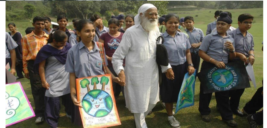
Sunderlal Bahugana and environmental protection