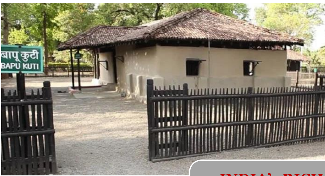
Gandhi and Sewagram