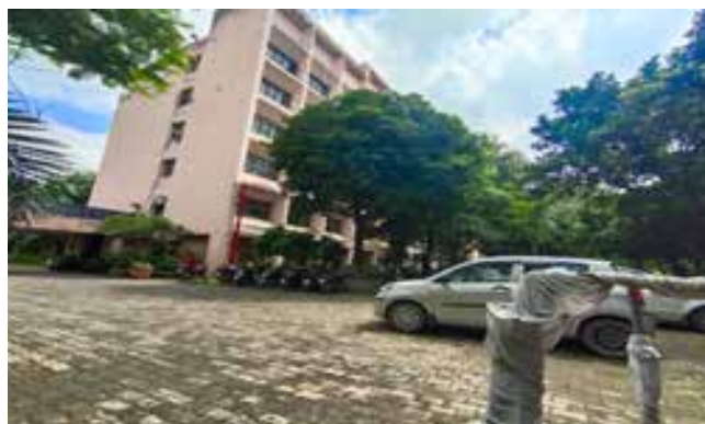
Qutab Institutional Area