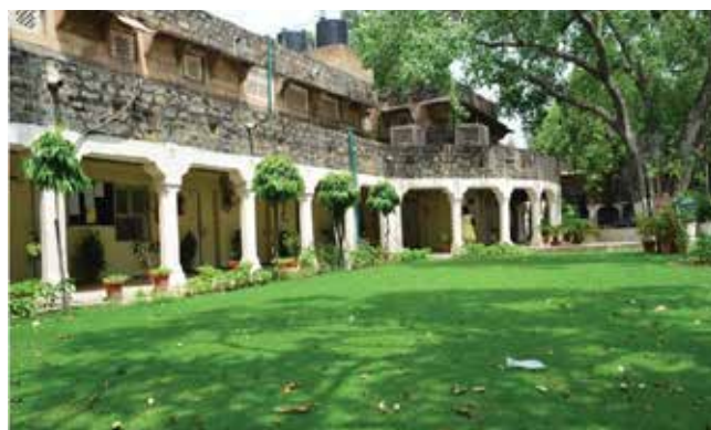
Kashmere Gate Campus