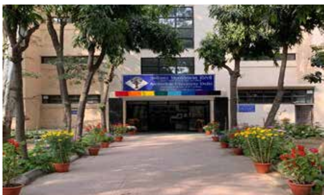
Lodhi Road Campus

The programmes offered by the School of Business, Public Policy and Social Entrepreneurship, School of Culture and Creative Expressions, School of Design, School of Development Studies, School of Human Studies, School of Human Ecology, School of Letters, School of Liberal Studies and School of Undergraduate Studies are available at the Kashmere Gate Campus. The programmes offered by the School of Global Affairs, School of Law, Governance and Citizenship and the School of Vocational Studies are available at the Karampura Campus. The programmes offered by the School of Education Studies are available at the Lodhi Road Campus. The programmes offered by School of Heritage Research management are available at the Delhi Institute of Heritage Research & Management, Qutab Institutional Area.